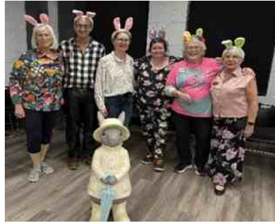
St. Patrick Day and Easter representation at Spring Dance